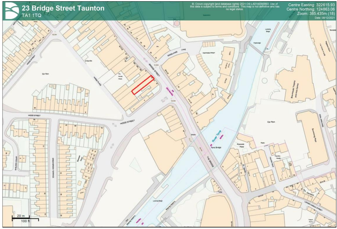
These particulars do not constitute any offer or contract and although they are believed to be correct their accuracy cannot be guaranteed, and they are expressly excluded from any contract.